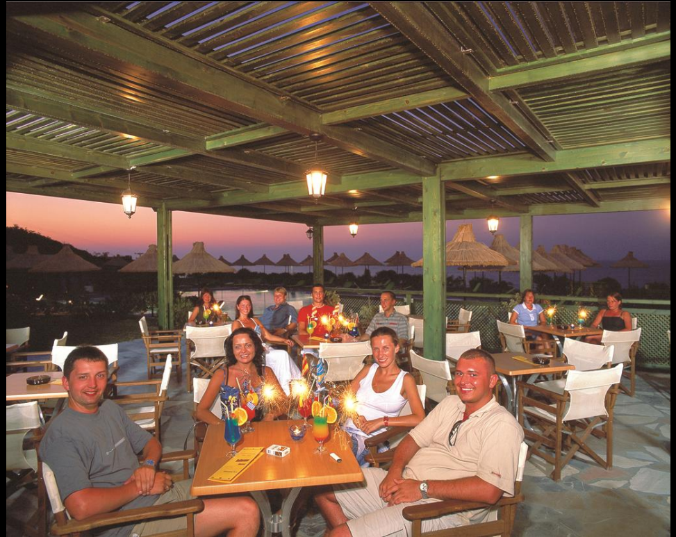
TERRACE & POOL BAR