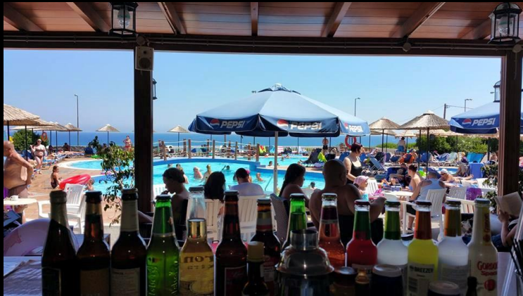
OCEAN VIEW POOL BAR